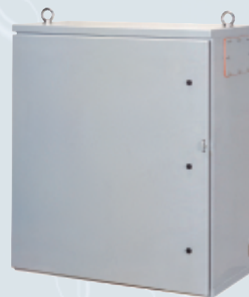
NEMA 4 totally enclosed Standard painted Aluminum