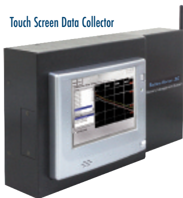
Touch Screen Data Collector

When failure is NOT an option, the Battery Advisor needs to be part of the plan